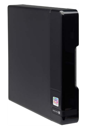
OXO Connect Compact Edition

To compete and succeed in today's marketplace, small- and medium-sized businesses (SMBs) need enterprise-class products. With increased simplicity, confirmed robustness and being connected,— all at a lower cost — the Alcatel-Lucent OpenTouch® Suite for SMB helps businesses grow.